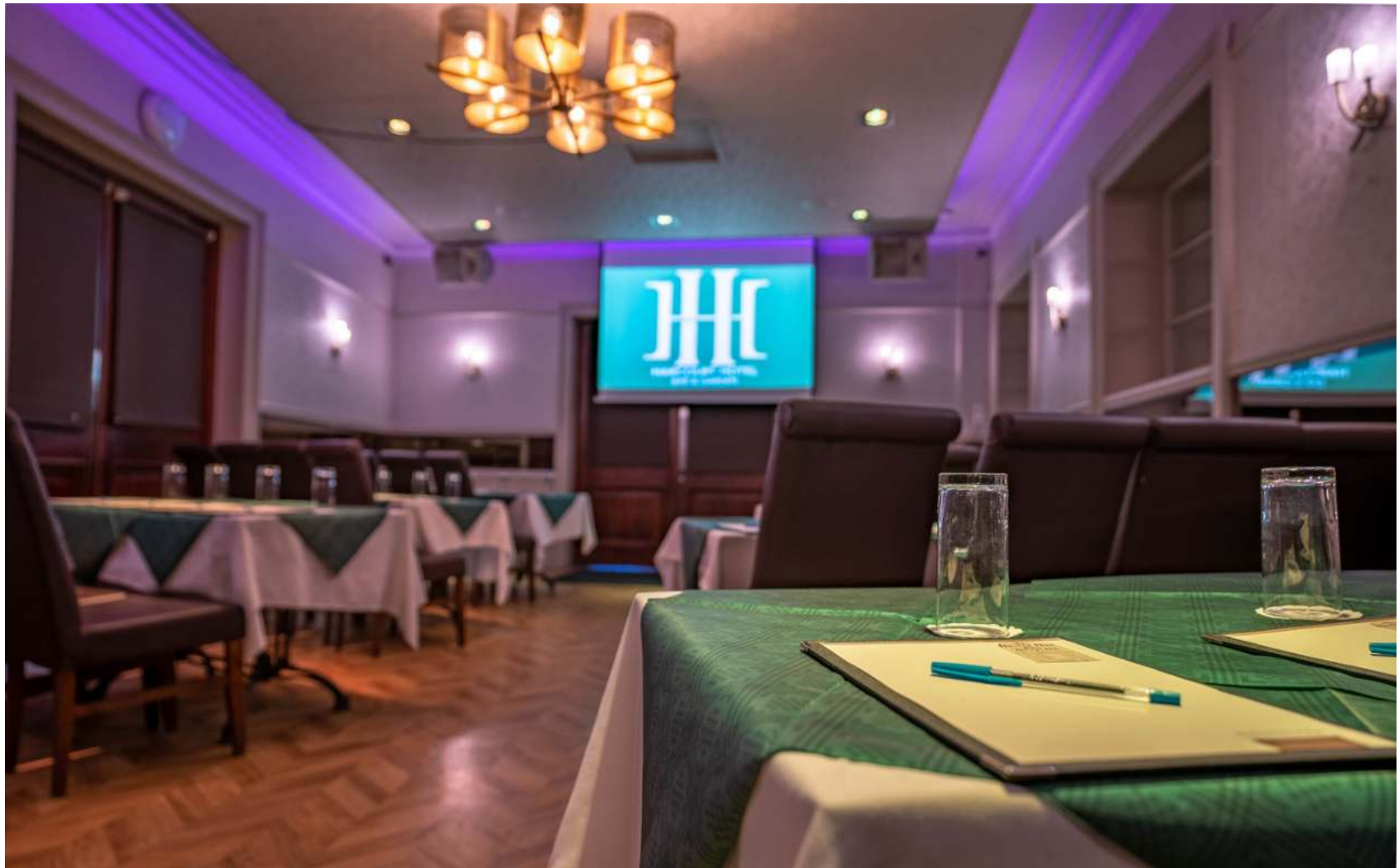
Intimate meeting room in the middle of Harcourt Street just in the Harcourt Hotel. Featuring two large screen, access to many features and fast wifi.